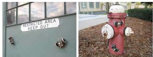
Figure 1. WallBots deployed on building façade (right) and on fire hydrant (left).

The first part of our study explores mechanisms by which artists and activists currently contribute to public spaces, including their motivations and their challenges. We scope our research around eight surfaces that can be used to host WallBots, among them trashcans, building walls, and bus stops. Participants are then introduced to WallBots through hands-on demos as well as videos of interaction techniques that can be used to manipulate the movement and appearance of wall-crawling robots. Our work presents participants’ feedback and ideas about possible uses of and interactions with WallBots in the context of their work. Drawing from an extensive tradition of participatory and iterative design research [2, 28, 33, 39], we leverage our findings to inform the development of low-cost autonomous agents as an authoring tool for public artists and activists.