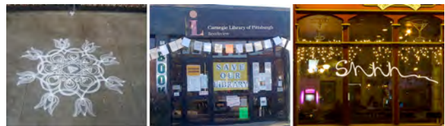
Figure 3. Example public expressions from our participants (left to right): Mandala painted on sidewalk, “save our library” flyers on library, light painting on building window.

To gain insights into the processes that drive public art and activism, we conducted a study of six participants who extensively contribute to public spaces. The study consisted of semi-formal interviews that investigate three themes: 1) participants’ current work, goals, and obstacles in public spaces, 2) participants’ expressions across eight surfaces that could serve to house WallBots, and 3) participants’ evaluation and appropriations of WallBots and interaction techniques that could be used to control them. Participants were recruited through an online bulletin board (Craigslist)