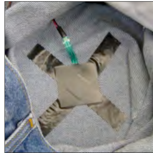
Figure 1. A FSR is attached to the knee area of a pair of jeans using electrical tape.

Based on A. R. Tindale's work on sensor strategies for capturing percussive gestures[1], the Ubiquitous Drum system uses wired drum pads, each built out of a force-sensitive resistor (FSR) and a pull-down resistor circuit. Two pads are taped into the inside of a pair of jeans (see Figure 1).