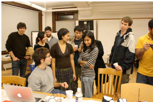
Figure 5. Making Things Interact final demos at CMU

Fundamentally, Ubiquitous Drums' success depends on whether or not people enjoy the interactive experience that it provides. Although our informal findings have been encouraging, we intend to conduct a thorough study to get a detailed profile of the system's prospective users. On one hand, we want to learn how long non-drummers interact with Ubiquitous Drums before losing interest. On the other hand, we want to investigate whether skilled drummers are able to play complex rhythms and get an acceptable musical response.