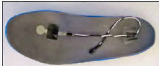
Figure 2. A FSR is attached to the sole of a shoe

Figure 3 shows the overall structure of the system.